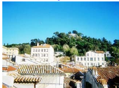
Chateau Hill View from Dining Area

The apartment is fully-equipped and furnished with a double bed and a large single mezzanine-level bed, cot, dining table and chairs, sofa, chest of drawers, television, CD/Radio, storage for suitcases, wardrobe hanging space and intercom. There is a separate fully-fitted kitchen with dishwasher, washing machine, fridge with ice box, hob and oven/grill and a shower room with a brand new power shower. It has very recently been renovated to a high standard.