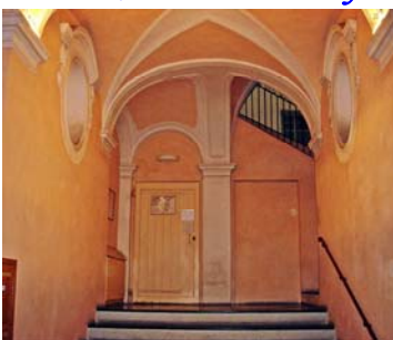
Communal Entrance Hall