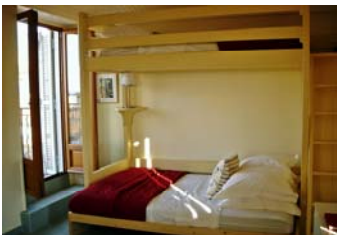
Bedroom Area with Balcony