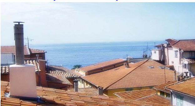
Sea View from Balcony

The beach and Promenade des Anglais are just a few steps from the apartment, at approximately 30 metres and the port is a five to ten-minute stroll. Old Nice's Main Square and the Cours Saleya, which is home to the famous daily flower market and local produce market, are also a few metres away. All the main restaurants and bars are situated in the Cours Saleya. It is a perfect base for exploring the Cote d'Azur with Monaco, Cannes and Antibes 15 minutes by train. Italy is just over 20 miles away and an hour by train.