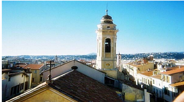
Church/Rooftop View from Balcony and Bedroom